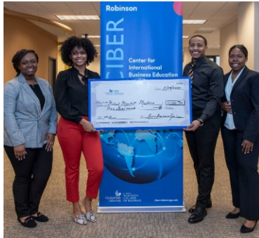
1st Place: Global Market Masters