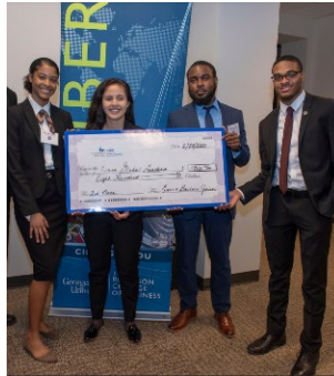
2nd Place: Team Global Leaders