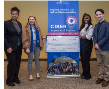
3rd Place: Team Impact

The full 2020 International Business Case Competition photo gallery is available for viewing here .